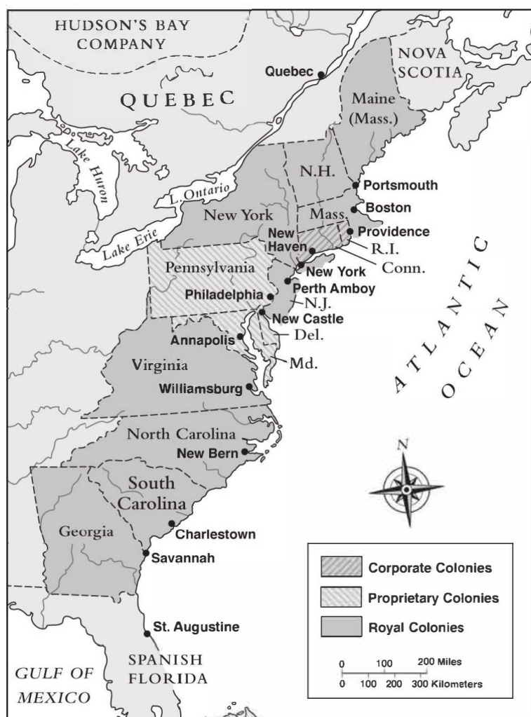
THE THIRTEEN ENGLISH COLONIES AROUND 1750

As a reward for helping him gain the throne, Charles II granted a huge tract of land between Virginia and Spanish Florida to eight nobles, who in 1663 became the lord proprietors of the Carolinas. In 1729, two royal colonies, South Carolina and North Carolina, were formed from the original grant.